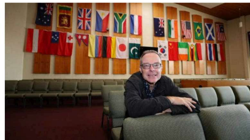
Invercargill's Community Service Day – a unity story

This is a truly remarkable initiative a number of churches have united to mobilising HUNDREDS of church members - on a Sunday morning – to achieve about 20 community service projects concurrently.